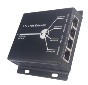
EXT-4POE EXTENDER 4 PORTS PO