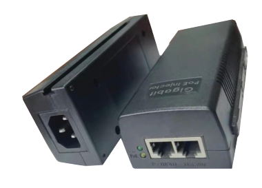
INJPOE25W INJECTOR POE 25 WATTS