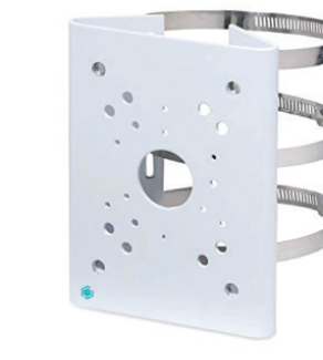
● PMB6 POLE MOUNT BRACKET