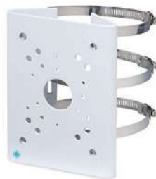
PMB6 POLE MOUNT BRACKET