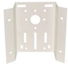
COMB6 CORNER MOUNT BRACKET