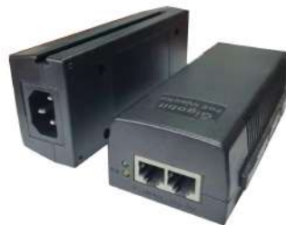
INJPOE-25W INJECTOR POE 25WATTS