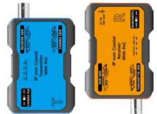
IP-COAX-300M IP OVER COAX EXT