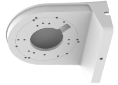
WMB2 WMB2-B WALL MOUNT