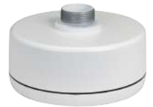
EB3BASE4-G GOOSE MOUNT