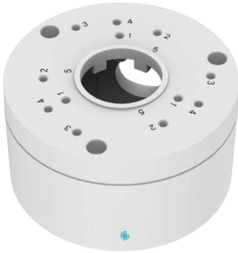
TEBBASE1 TEBBASE1-B JUNCTION BOX