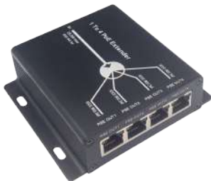
EXT-4POE EXTENDER 4 PORTS POE