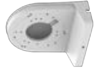
WMB2 WALL MOUNT