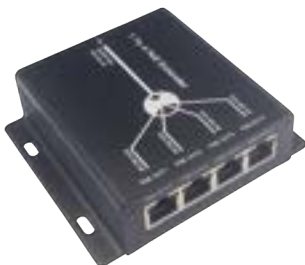
EXT-4POE EXTENDER 4 PORTS POE