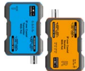
IP-COAX-300M IP OVER COAX EXT