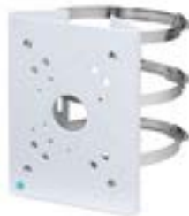
PMB6 POLE MOUNT BRACKET