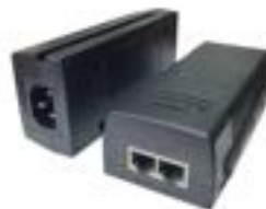
INJPOE-25W INJECTOR POE 25WATTS