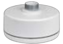
EB3BASE4-G GOOSE MOUNT