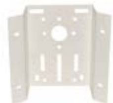
COMB6 CORNER MOUNT BRACKET