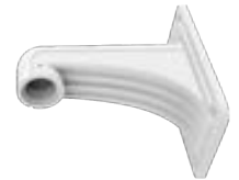
WMB6 WALL MOUNT