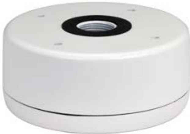
TEBBASE1 JUNCTION BOX