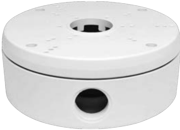
EB3BASE3 JUNCTION BOX