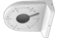
WMB5 WALL MOUNT