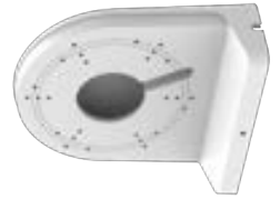
WMB5 WALL MOUNT