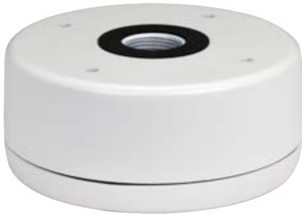
EB3BASE4 JUNCTION BOX