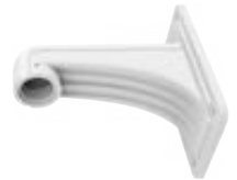
WMB6 WALL MOUNT