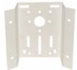
COMB6 CORNER MOUNT BRACKET