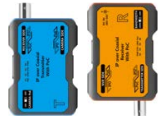
IP-COAX-300M IP OVER COAX EXT