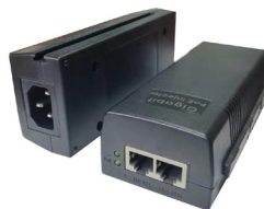
INJPOE-25W INJECTOR POE 25WATTS