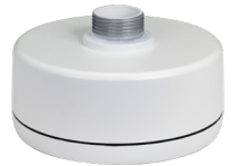
EB3BASE4-G GOOSE MOUNT