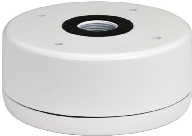
TEBBASE1 JUNCTION BOX