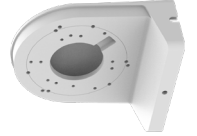
WMB2 WALL MOUNT