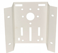
COMB6 CORNER MOUNT BRACKET