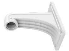
WMB6 WALL MOUNT