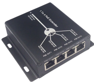
EXT-4POE EXTENDER 4 PORTS POE