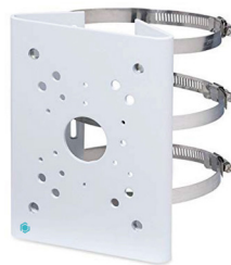
PMB6 POLE MOUNT BRACKET